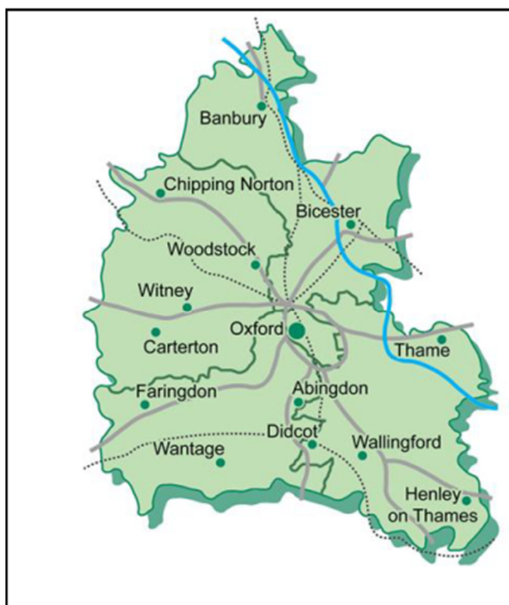
Figure 1: Oxfordshire Study Area (OCC 2014a)

The study area comprises the entire county of Oxfordshire (see Figure 1), which is located in the south east of England. The county comprises the districts of Oxford, Cherwell, Vale of White Horse, West Oxfordshire and South Oxfordshire.